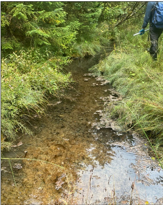
Figure 2.—Upstream at waypoint 1054.