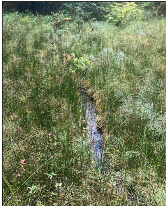
Figure 3.—Upstream at waypoint 1056.