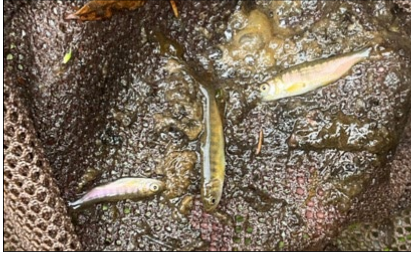
Figure 1.—Juvenile coho salmon caught at waypoint 1054.